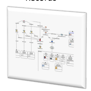
Commercial Registers & Business Network Analysis