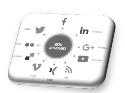
Social Media Analysis